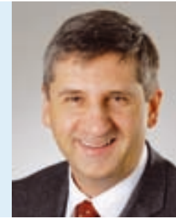
Dr. Reinhold Mitterlehner Federal Minister for Economy, Family and Youth, Republic of Austria

This Year's conference highlights the effects of the financial crisis on the regions and cities in Europe.